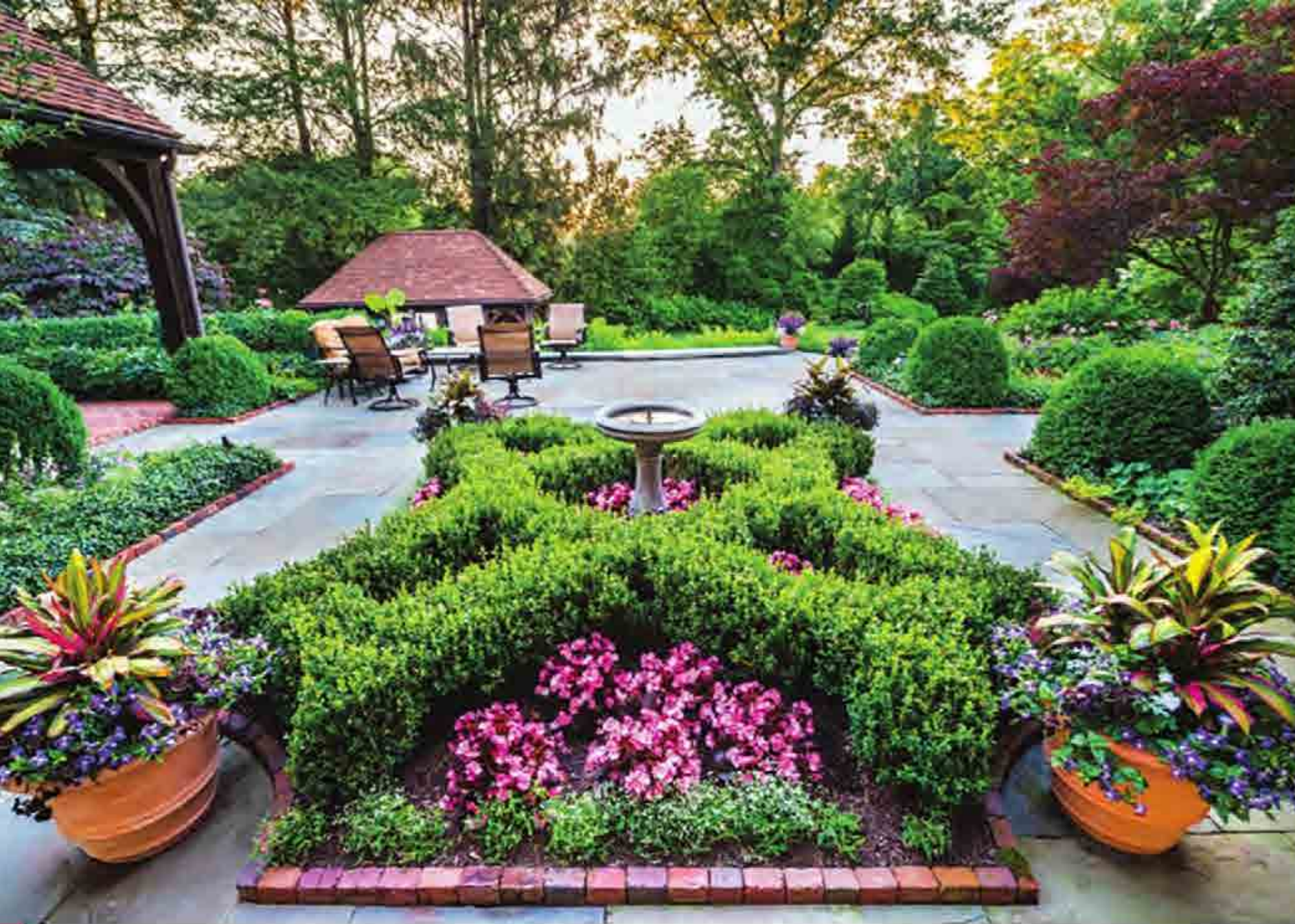
The owners were looking for functional outdoor spaces to fit every mood and occasion.