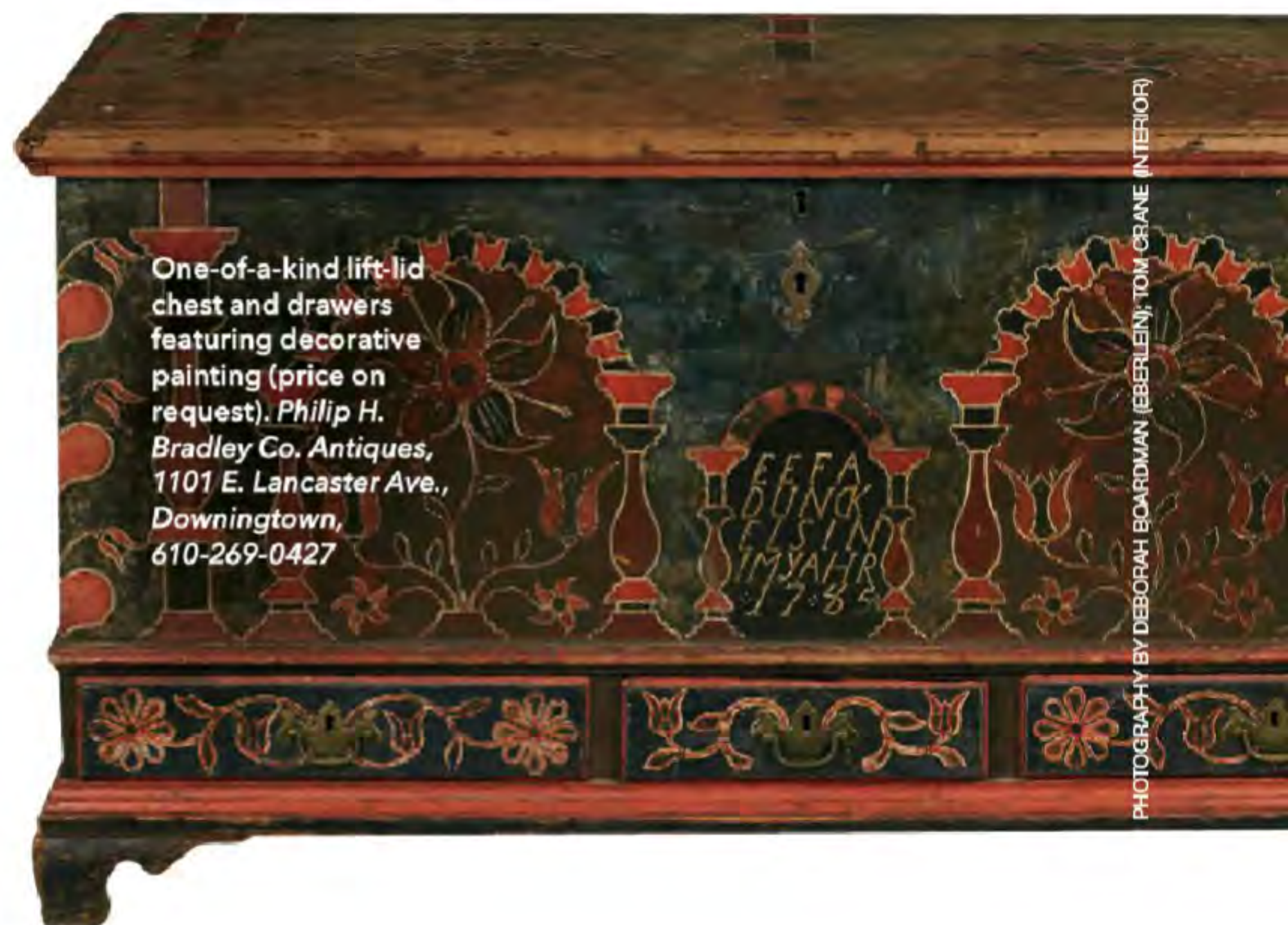
One-of-a-kind lift-lid chest and drawers featuring decorative painting (price on request). Philip H. Bradley Co. Antiques, 1101 E. Lancaster Ave., Downingtown, 610-269-0427