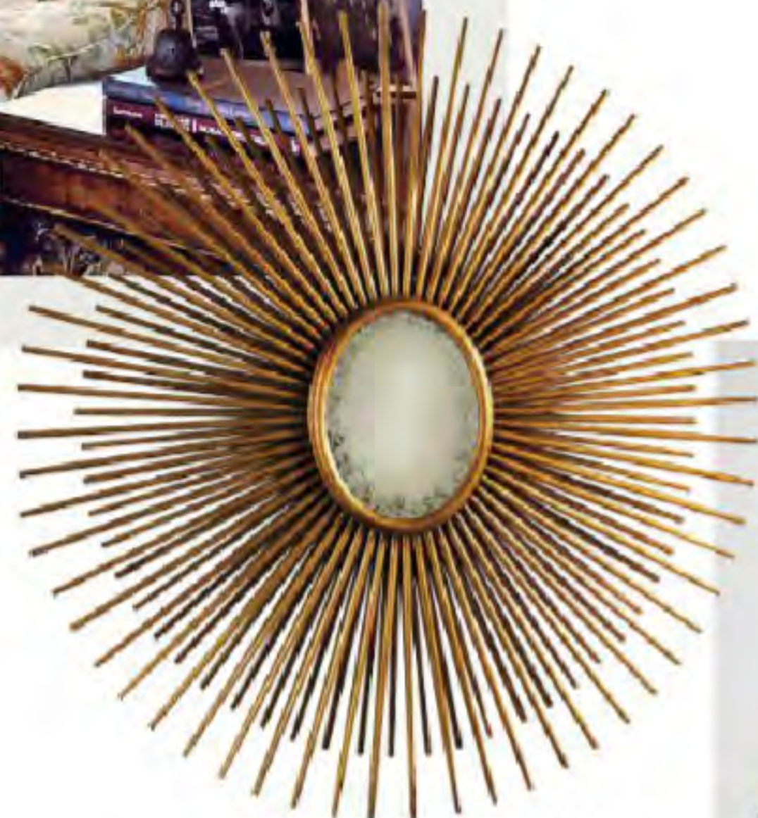
Oval Florentine mirror (price on request). Chelsea House Ltd., 45 Haverford Station Road, Haverford, 610-896-5554; chelseahouseltd.com